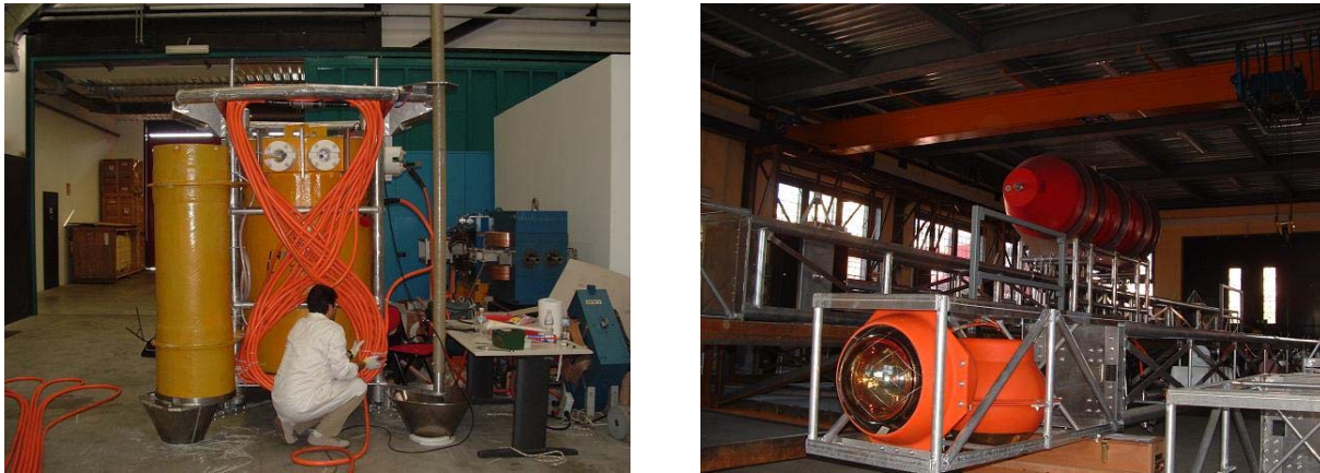
Figure 2. The Junction Box (Left) and the mini-tower (Right) under assembling.

Although the Phase 1 project will provide an important test of the technologies proposed for the realization and installation of the detector, these must be finally validated at the depths needed for the km 3 detector. For these motivations the collaboration undertake the Phase 2 of NEMO, i.e. the realization of a dedicated infrastructure in the Capo Passero site. It will consist of a 100 km underwater electro-optical cable (linking the 3500 m deep sea site to the shore), a shore laboratory, located inside the harbour area of Capo Passero, and underwater infrastructures (underwater connectors, power transformers,...). The completion of this project is expected by the end of 2007 and will allow the connection of prototypes of the detector and instrumentation for long term on-line monitoring of the site properties.